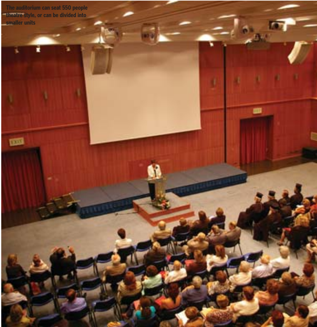
The auditorium can seat 550 people theatre style, or can be divided into smaller units