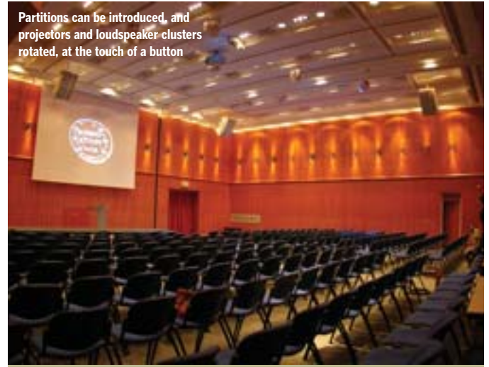
Partitions can be introduced, and projectors and loudspeaker clusters rotated, at the touch of a button